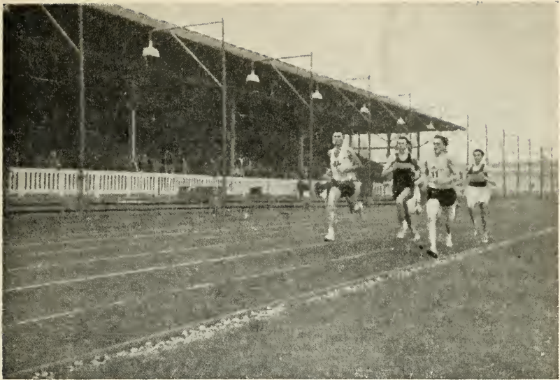
The 880 yard race at Manchester.